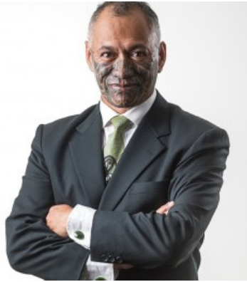
Ngahihi o te ra Bidois

“Ngahi was thoroughly engaging and inspirational”